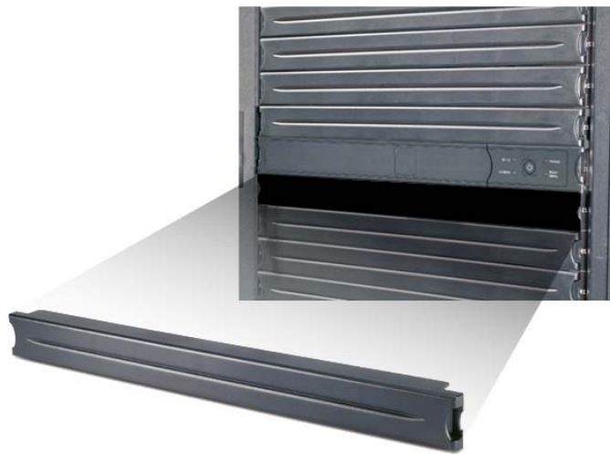
Figure 2b – Snap-in feature of blanking panel